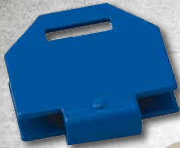
7083 Blue Box™ for hinge cuffs