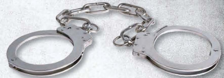
9000/9000C Legcuffs 5259 Extra Oversize Legcuffs